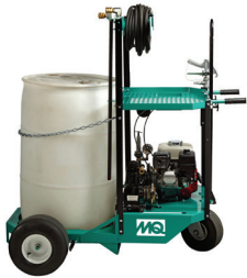
Mobile Cart WSC55