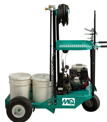
Drum size variations

MQ Whiteman products are only available through authorised dealers in Australia. Click here to find your nearest authorised dealer.