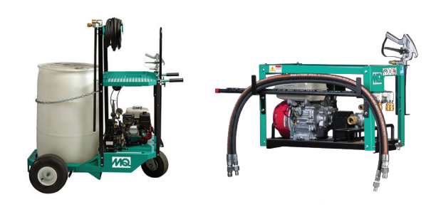
Mobile Cart WSC55